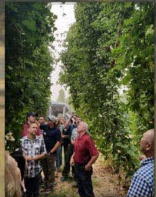
Class 39 - Ag Seminar, Prosser Hops