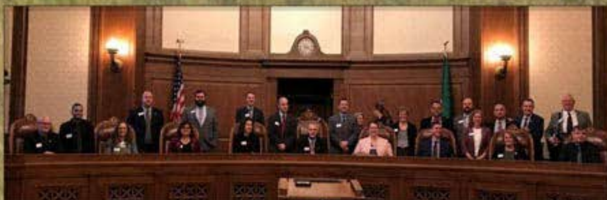
Class 40 - State Government Seminar - Olympia Washington State Supreme Court