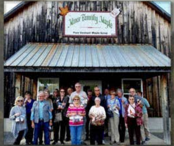
Alumni Council - New England Adventure 2017