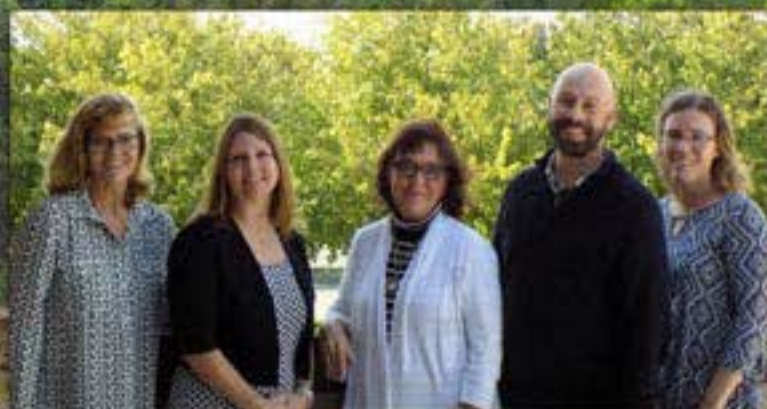
AgForestry Leadership Foundation Team

90 CENTS OF EVERY DOLLAR YOU GIVE GOES DIRECTLY TO PROGRAM SERVICES