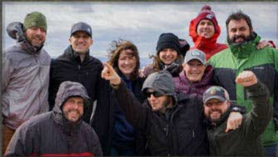
Class 40 - National Seminar, Washington DC

Classes 39, 40 and our Alumni continue their leadership journeys