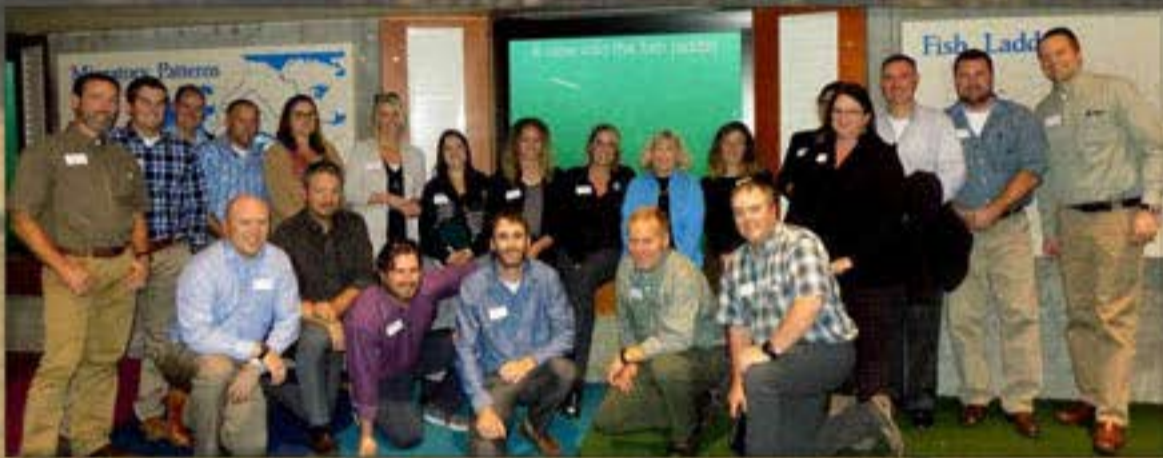
Class 39 - Columbia River Seminar, Bonneville Dam