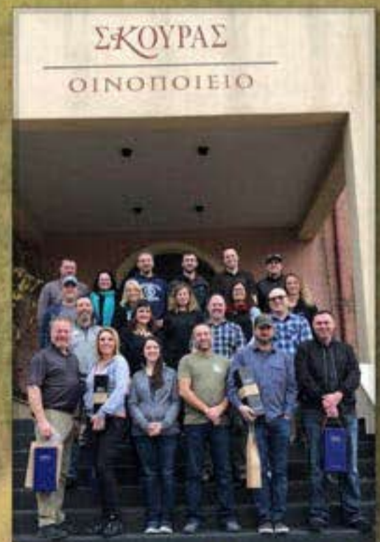
Class 39 - International Seminar, Greece