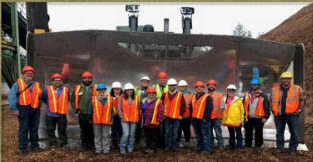
Class 40 - Forestry Seminar, Avista Generating Station, Colville