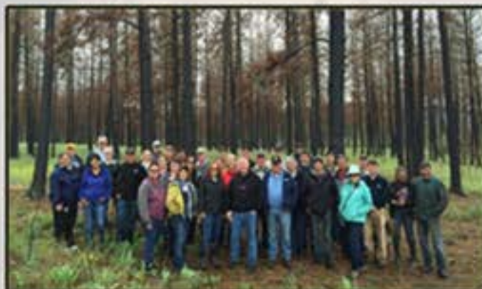
Dedicated AgForestry Alumni and Leaders from across the state participated in the Okanogan Fire Conference in May, 2016.