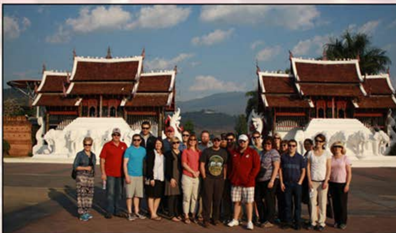
Leadership Class 37 / Thailand