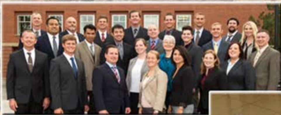
LEADERSHIP CLASS 38